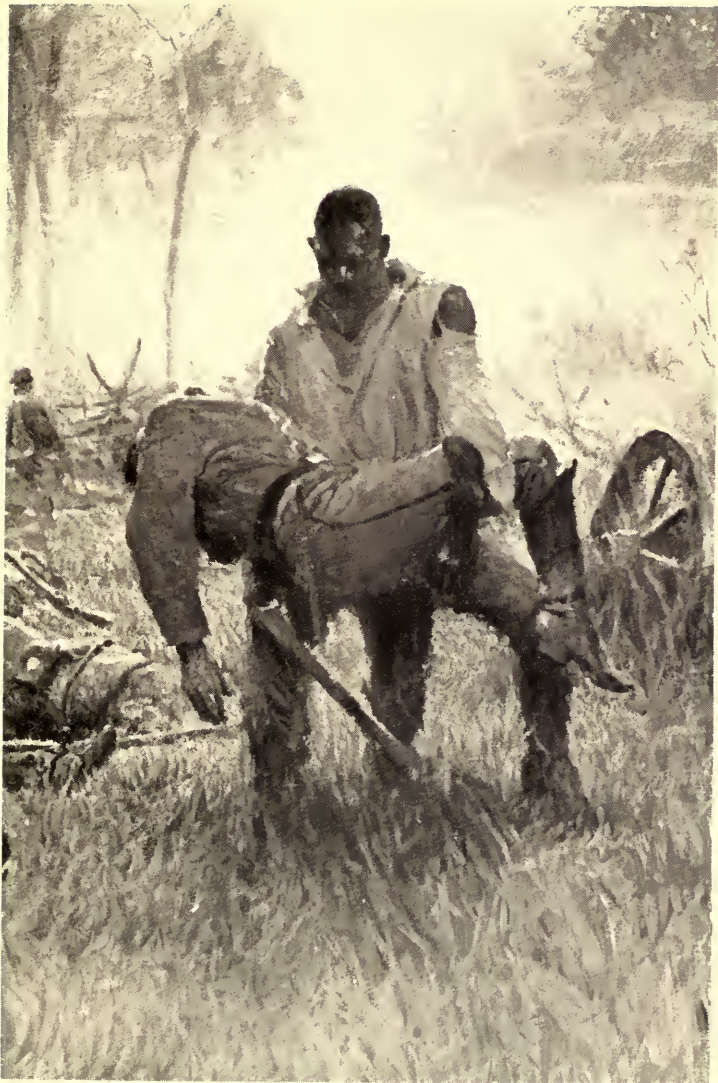
"HE WARN'T NOTHIN' BUT JES' A BOY EZ I TOLD YOU."